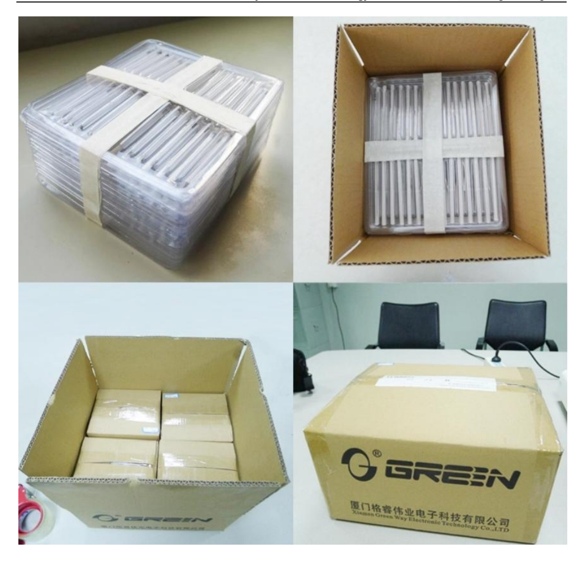
Fast International Express Delivery such as DHL,TNT,FEDEX, UPS ect.